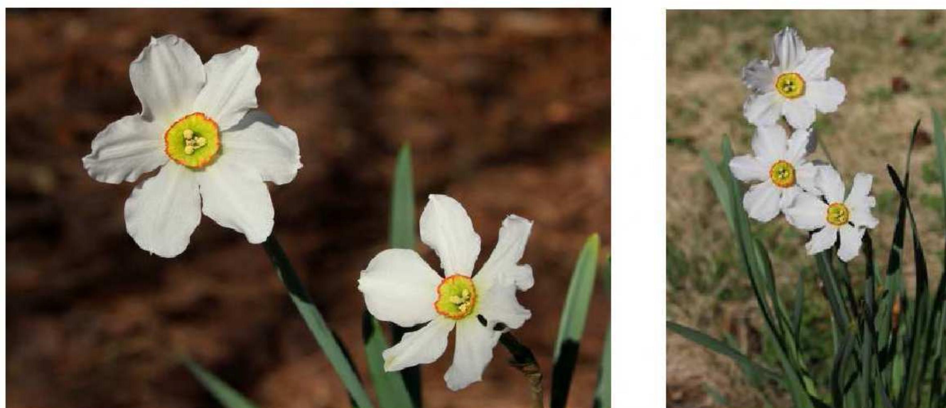
Figure 8. Narcissus poeticus , roadside, Lauderdale Co., Alabama, 20 Mar 2014.

Roadsides and old home sites; mostly northern Alabama; rare; March–April. This daffodil is introduced from Europe and has naturalized in the eastern half of USA and Canada, but appears to be more common further north (BONAP 2013). Almost all the plants identified as this species from Alabama were actually the hybrid Narcissus × medioluteus , which can have solitary flowers but lacks the distinctive red-margined rim on the corona. The flowers of Narcissus poeticus are a little larger than N. × medioluteus , but they are always solitary. [GA, MS, TN]